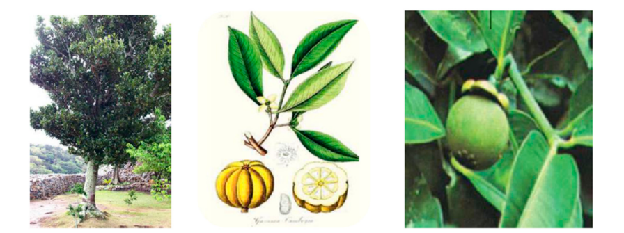
Figure 2. Tree, branch, and fruit of Garcinia cambogia.

The effects of HCA are associated with a reduction in food intake via serotonin level regulation and metabolic modifications, such as an increase in fat oxidation, a decrease in de novo lipogenesis and the stimulation of hepatic glycogenesis, thus promoting energy expenditure. HCA is a competitive inhibitor of adenosine triphosphate (ATP)-citrate lyase, an enzyme that catalyzes the extramitochondrial breakdown of citrate into oxalacetate and acetyl-CoA, thus limiting the availability of acetyl-CoA, a compound that plays a key role in the synthesis of fatty acids in diets rich in carbohydrates (Figure 3).