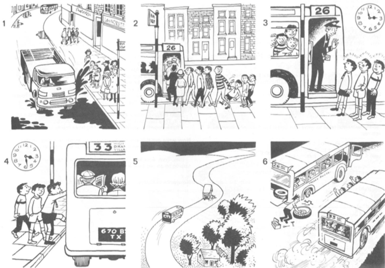
Figure A1. Stimulus for written production task.