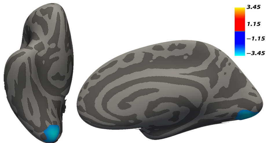
Figure 2. The increased cortical surface area in Neglect versus Control groups. The cluster comprises lingual and lateral occipital regions. Background brain images represent the inferior ( left image) and medial ( right image) views of the right inflated hemisphere (FreeSurfer) fsaverage brain. Note: p < 0.05 cluster-wise corrected, 10,000 Monte Carlo iterations, age, total intracranial volume (TIV) and Psychiatric Disorders were used as nuisance covariates for the cortical surface area analysis.