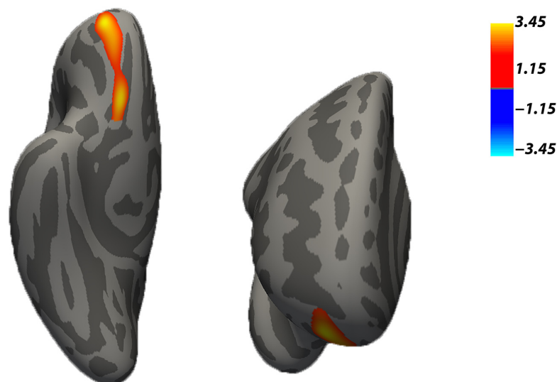
Figure 1. The cortical thickness reduction in Neglect versus Control groups. The cluster comprises the right rostral middle frontal gyrus, as part of the dorsolateral frontal gyrus, and the lateral and medial orbitofrontal areas. Background brain images represent the inferior ( left image) and anterior ( right image) views of the right inflated hemisphere of (FreeSurfer) fsaverage brain. Note: p < 0.05 cluster-wise corrected, 10,000 Monte Carlo iterations, age, and Psychiatric Disorders were included as nuisance covariates for the cortical thickness analysis.

The results in the cortical surface area, applying a CFT = 0.001, revealed a significant pattern of greater surface area in mothers of the NG with respect to the CG (CG < NG) in the occipitotemporal region previously hypothesized. The analysis showed a large cluster ( p = 0.0002 , see Table 3 bottom and Figure 2) extending over the right lingual and lateral occipital gyri of the right hemisphere.