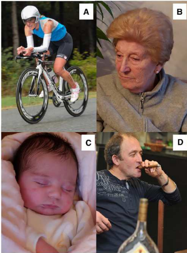
Fig. 1. Four contrasting people subject to varying medical risk factors, illustrating the parallels between prospective medical patients and potentially impaired river ecosystems. Medical doctors use the same general approach, but different sets of indicators in the diagnosis of each patient. For example, a pregnancy test would be relevant only for individual A. Similarly, although all four people could have lung cancer, the probability is much higher for individual D. All four individuals could be subject to a physical performance test, but expectations on healthy performance and future health goals would differ widely. The medical goals would also differ: top physical performance (A), relatively autonomous and painless life (B), early detection of emerging problems (C), and changing risky habits (D).

Differential diagnosis is equally applicable to ecosystems (Fig. 2), where it could be defined as a systematic approach to distinguish, based on unique sets of characteristics, between two or more potential causes of ecosystem impairment that share symptoms. Differential diagnosis starts with broad indicators and progresses using increasingly specific criteria to screen out potential causes of a problem (Box 1). A wide range of indicators has been developed. Examples for river ecosystems (Bonada et al., 2006; Woolsey et al., 2007; Friberg et al., 2011) include some with specific targets, such as diatom indices to reveal impacts of acidification (Van Dam, 1988). However, a general diagnostic framework for selecting indicators to differentiate among multiple causes of ecosystem impairment is lacking. Many indicators (e.g. macroinvertebrate community structure) have been developed to provide an integrated assessment of general ecological state, and therefore offer little diagnostic power. First steps have recently been made towards establishing a differential diagnosis approach to river assessment (Elosegi and Sabater, 2013), but clearly more development is required in theory and practice. This includes integration of both the structural and functional dimensions of ecosystem condition (Bunn and Davies, 2000; Gessner and Chauvet, 2002) in a systemic perspective.