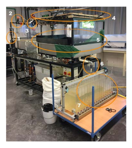
Figure 1: Modified hydrology bench and volume measuring device. (1) Rotameter; (2) Valves; (3) Water meter; (4) Drippers; (5) Material vessel; (6) Outflow; and (7) Hydrograph buckets.

The duration of test rain was 15 minutes, common time of concentration for an urbanized area network collection points. It is also common to design traditional drainage networks with 10-year return period storms. For this reason, the rainfall intensities applied in the laboratory tests were 35 mm/h and 70 mm/h, corresponding to rains of 15 minutes duration and return periods of 2 and 10 years for the Igeldo meteorological station IDF curves [19], located in the municipality of Donostia/San Sebastián. In that respect, previous laboratory tests for permeable pavements selected rainfall intensities ranging from 5 mm/h to 60 mm/h [5], [9], [10]. For measuring the infiltrated flows and generate the output hydrographs, a hydrograph bucket was placed at the exit of the test bench (6 and 7 in Fig. 1). The measurement of the rain flow was made during 30 minutes (15 minutes with rain and 15 minutes without rain). The bucket had 16 containers with a surface of 17800 mm<sup>2</sup> each, and a capacity of 6.5 litres per container. In this way, using 14 of the 16 cuvettes, the duration of the hydrograph was divided into 28 non-homogeneous intervals.