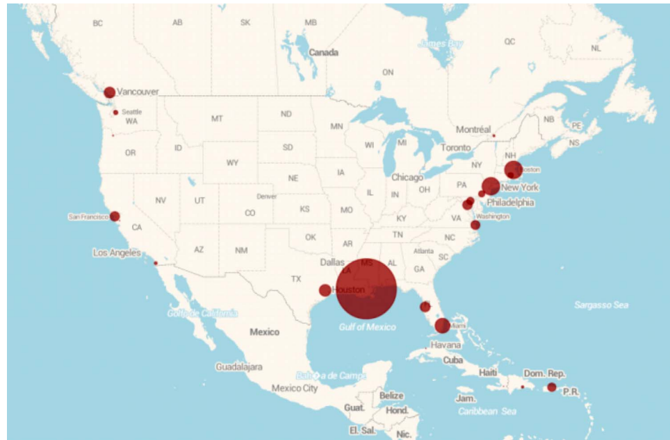
Figure 1. Risk in major US coastal cities in the middle of the road sea-level rise scenario (RCP4.5) in 2050. Circles represent the risk measured as the average damage of 5% worst cases.

generate 10% of global GDP; around 600 million people currently live within 10 m of present-day sea level (McGranahan et al 2007). Sixty percent of cities with a population over 5 million are located within 100 km of the coast and population densities in coastal areas in 2000 were five-fold larger than the average (Small and Nicholls 2003, Neumann et al 2015). Risk exposure in coastal areas is expected to increase during the following decades due to sea-level rise and extreme events, but also as a result of population growth and associated urbanization processes (Neumann et al 2015).