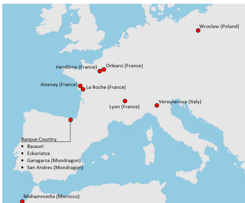
Figure 1: FED's production plants in 2013.

FED had a 30% equity participation in another production plant in Shanghai (China).