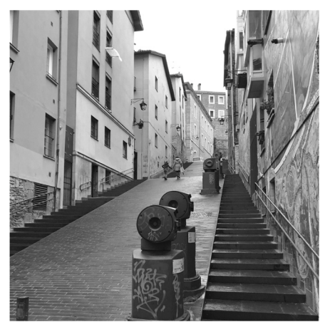
Photo 2. left and middle: project rendering for the Old Town project (from Paisaje Trasversal, 2022); right: one of the narrow Old Town streets as possible space for small-scale greening interventions (photo by the authors, June 2022).