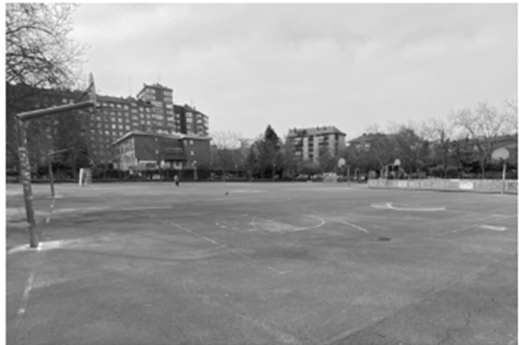
Photo 1. left: Information booth presenting the Los Herrán Street project; right: the campos negros, (eng. black fields) with their current use as basketball fields, to be transformed.

of designated areas for competitive and often male-dominated sports. However, the planners' proposed design risks overrunning the neighborhood's historic place attachment that grew around multi-cultural competitive sports. A member of the adjacent neighborhood association explains: