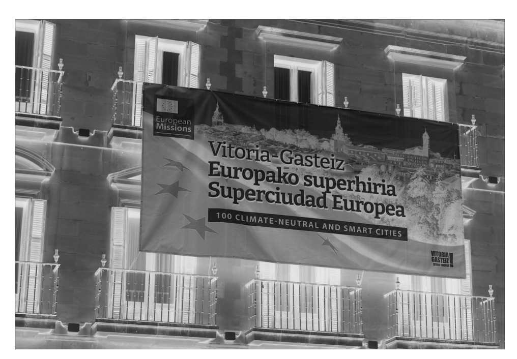
Photo 3. Marketing campaign of Vitoria-Gasteiz' city-hall announcing the city as "European Supercity" in Spanish and Euskera (photo by the authors, June 2023).

We have analyzed the extent to which MAEF allow for the democratization of local governance of urban renaturing programs, prioritizing civic participation, inclusion, and equity. We have drawn on qualitative data around two urban naturalization projects currently implemented under the NGEU framework in the city of Vitoria-Gasteiz. Our findings show that funding requirements diverge from locally envisioned values about governance through conflicted perspectives of participation, inclusion, and equity by civic and institutional actors. We argue that civic