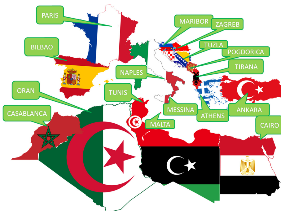
Figure 1 Map of referral centers in the participating countries.

Based on the facilities and tests available in each center, for each case we estimated the probability of being diagnosed with CD by the new ESPGHAN diagnostic criteria alone, without small intestinal biopsy. For each case we summed up the number of diagnostic criteria met (clinical symptoms, tTG above 10 folds the upper limit of normal and specific HLA). The sum of the criteria determined the final diagnostic score, which thus ranged from 1 to 3. To reduce large tables, countries were often aggregated within their geographical region (Europe, Balkans, North Africa).