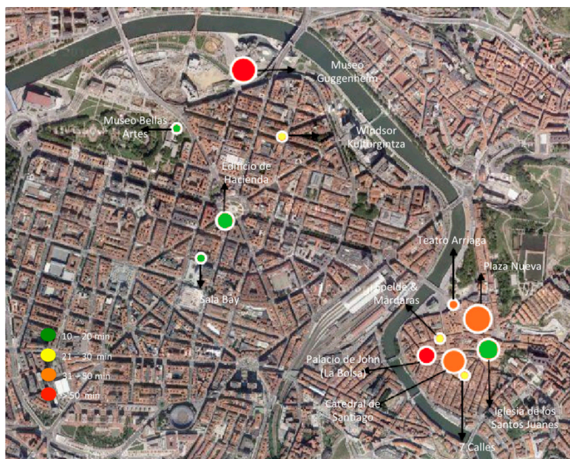
Figure 2. The most visited cultural sites in Bilbao City Centre. CICtourGUNE [50].

In Figure 2, the visits to the cultural resources have been summarized. This is another way to show the time–space consumption. On this map, the most visited cultural sites from Bilbao are represented by a circle. Note that the size of the circles is proportional to the number of visits for each cultural site, and the length of the visits is shown by the color of the circles. As can be seen, the longest visits are related to the Guggenheim museum and the “Palacio de John (Edificio La Bolsa)”.