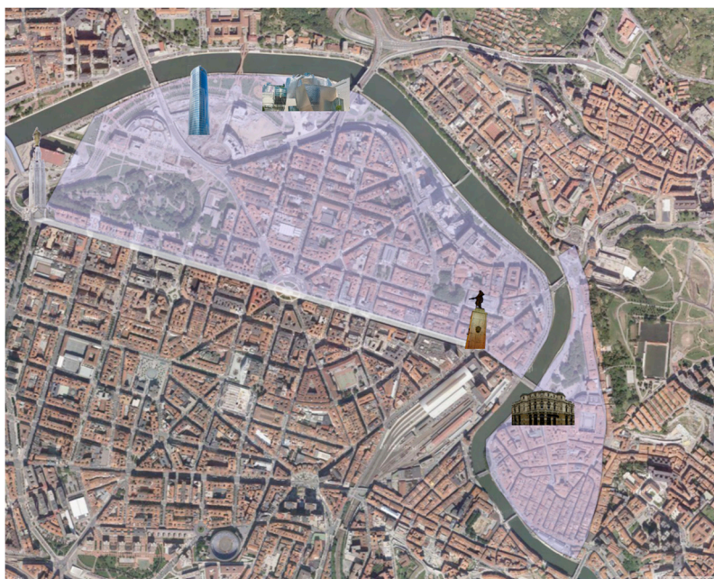
Figure 4. The main Tourism-related Lynch elements in Bilbao: A simple and eligible shape.

The image of the city space perceived from these elements is relatively simple, and it can be represented with a simple shape (“D-shaped”). This implies that Bilbao as a tourist destination has a simple legibility. Furthermore, examining the tourist maps supplied by the Bilbao tourist offices reveals that about 60% of POIs marked on the map belong to the two main areas analyzed: the Old Town and Abandoibarra. Thus, the visitors integrate the spatial elements of the city and the information of the city that they consume, and each visitor generates their own mental map of the city. To extract a general mental map is not easy, but it can be said (as has been seen in Figures 1 and 3) that the mobility of the tourists is closely associated with these spatial elements and with the consumed information, so mobility is somehow related with the mental map of the visitors.