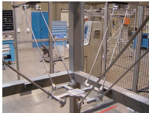
Fig. 1 Prototype of Schönflies parallel manipulator. CompMech Research Group, Department of Mechanical Engineering UPV/EHU/

As said the so-called Shönflies motion , is quite demanded in pick & place operation. A recent design is the SMG (McGill University) [11]. The CompMech research group has also developed a prototype with Schönflies motion (Figure 1) whose final dimensions were obtained from a multiobjective optimization. [12].