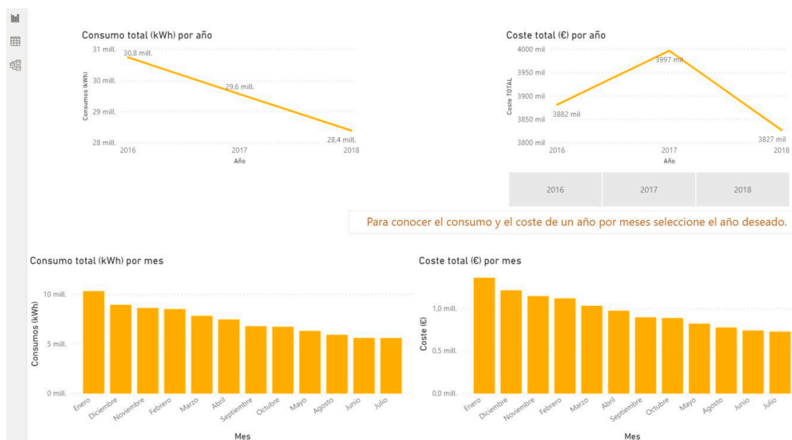
Figure 3. Example of PowerBI city dashboard; summary of Vitoria-Gasteiz (Spain) public lighting inventory; years 2016–2018.

Regarding the quantification of CO 2 emissions reduction and energy savings, the functionalities of ENER-BI DSS have been split into three modules, according to the different needs of the city decarbonisation planning process, taking the steps of Cities4ZERO decarbonisation methodology as a reference.